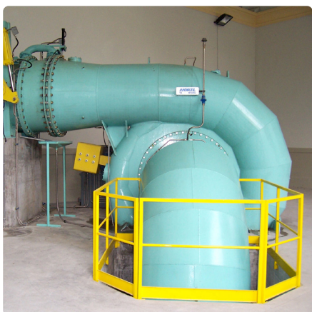
COLDIMOSSO POWER PLANT TURIN

The average annual production is approximately 60 million kWh, with an overall electricity generating capacity of 12 MW.