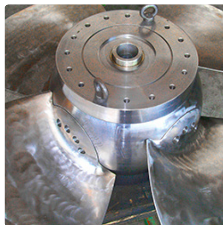
MOLINO NUOVO POWER PLANT PAVIA

Following revamping in 2006, the hydroelectric unit is made up of two vertical axis Francis turbines with a total installed power of 3,600 kW and an average production of 18 million kWh per year.