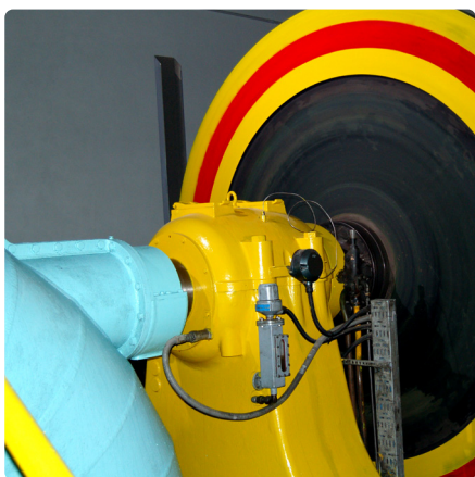
CUNELLA POWER PLANT BERGAMO

The hydroelectric unit is made up of a vertical axis, double-regulated Kaplan turbine with installed power of 50 kW and an average production of 350,000 kWh per year.