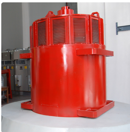
LENNA POWER PLANT BERGAMO

The hydroelectric unit is made up of a horizontal axis Francis turbine with installed power of 1,380 kW and an average production of 7.5 million kWh per year.