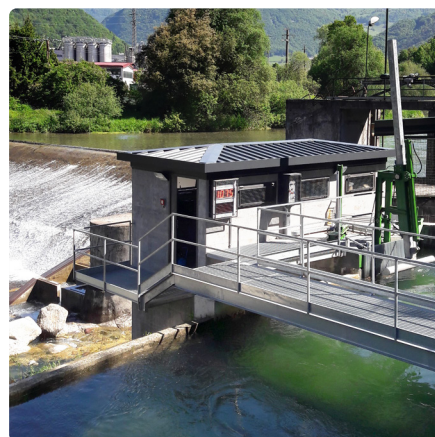
CAMPIGNANO MVF POWER PLANT BERGAMO

The hydroelectric unit is made up of a vertical axis Kaplan turbine with installed power of 1,560 kW and an average production of 8 million kWh per year.